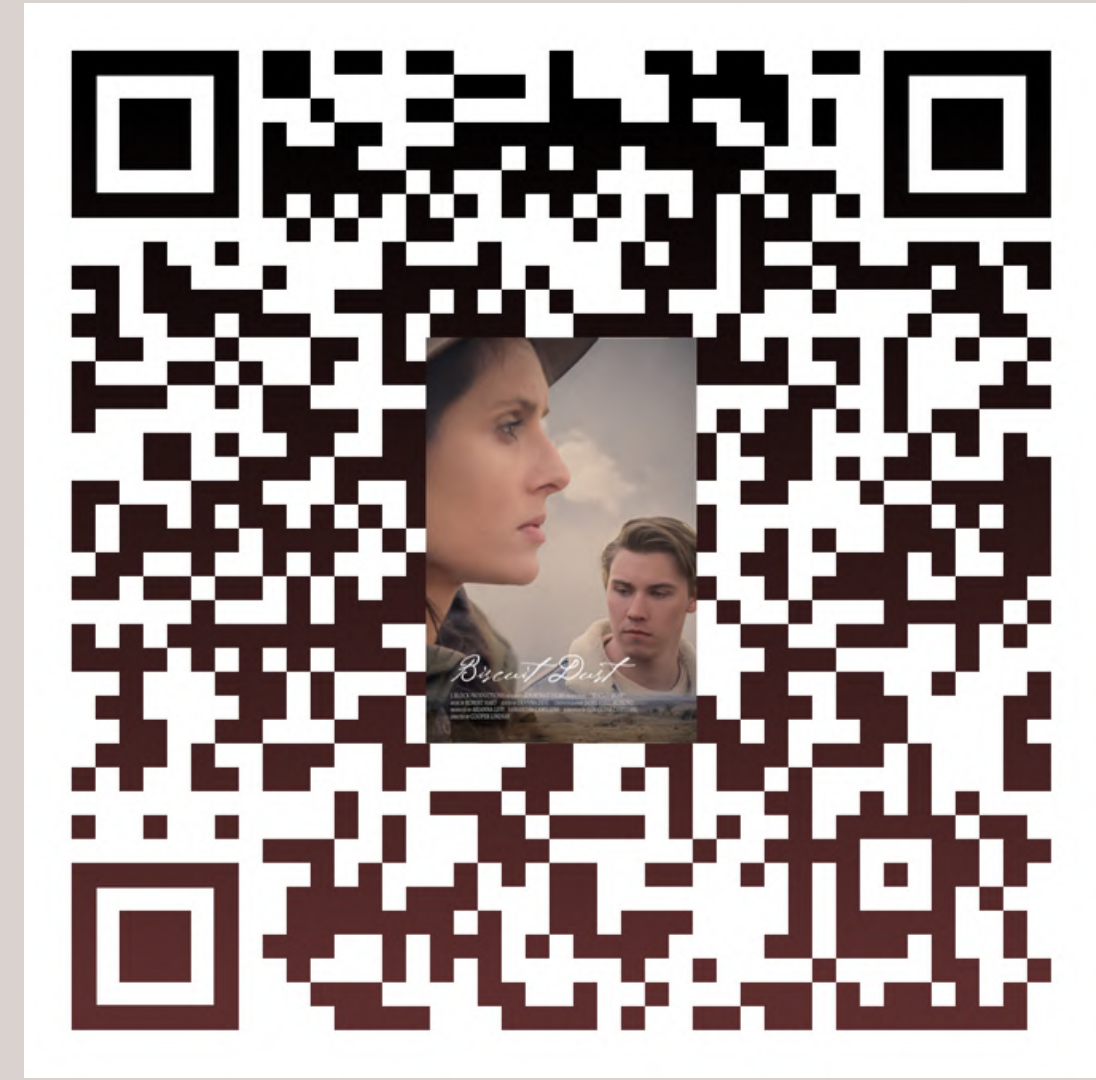
'Biscuit Dust' Trailer